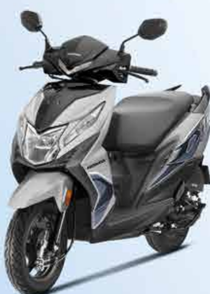
PEARL IGNEOUS BLACK + PEARL DEEP GROUND GRAY